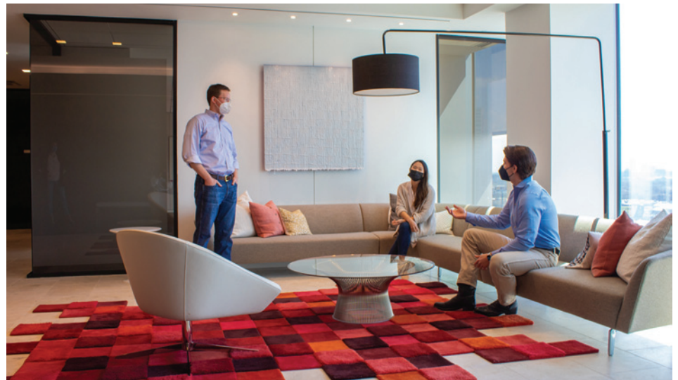
Associates interacting in the lobby of BoyarMiller in Houston after the firm reopened its office during the COVID pandemic in 2021.