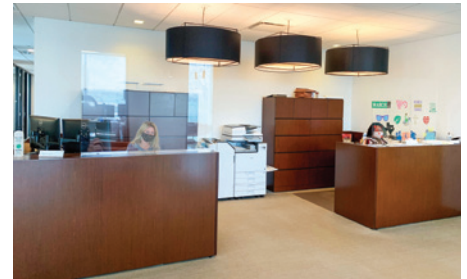
BoyarMiller offices in Houston reopen during the COVID pandemic in 2021.

we are comfortable where cases come down, it's not so obtrusive," he said.